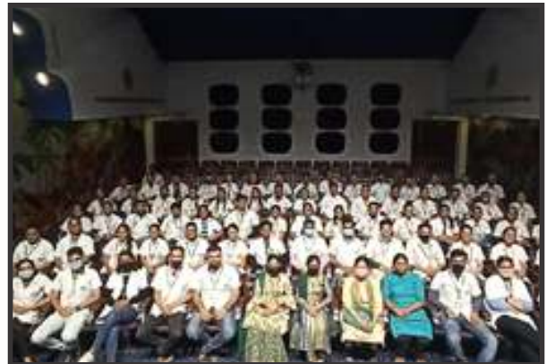
Students of 4th BHMS JNHMC Parul University went on an Education Field Visit at Amul Dairy - Anand, arranged by Dept. of Community Medicine as a part of their curriculum on 2nd July 2022.