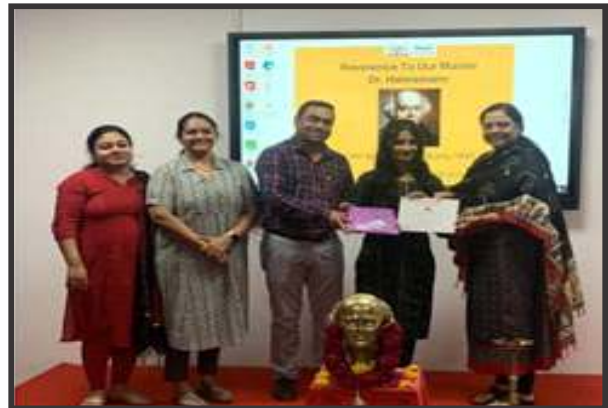
On 2nd July Expressed whole heartedly by the faculties and AHMC students for our Master, Dr Samuel Hahnemann on his 179th death anniversary.