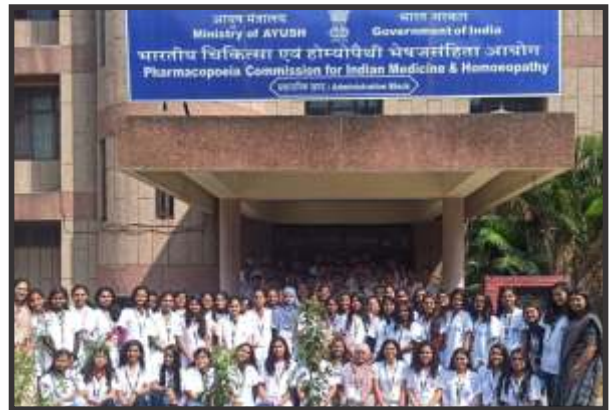
On 8th & 9th July First BHMS students of AHMC visited *Pharmacopoeia Commission for Indian Medicine and Homoeopathy* Ghaziabad