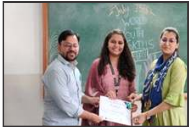
Jawaharlal Nehru Homoeopathic Medical College, Parul University has organized Mega Skills Fest on the occasion of International Youth Skills Day on 15th July 2022 at 1.30 pm at P.G department, JNHMC.