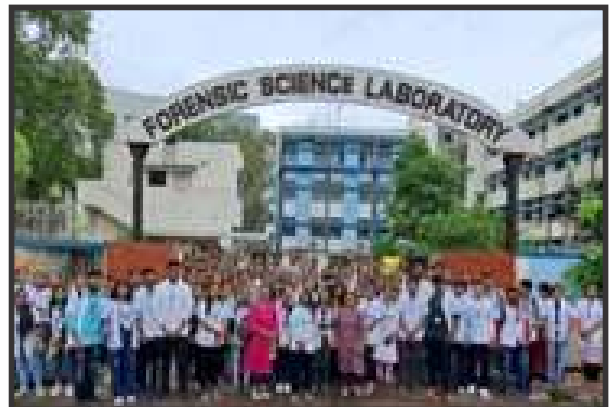
An educational visit to Ahmedabad Forensic Science Laboratory has been organised by Ahmedabad Campus on 26th of July where students of 2nd year BHMS were enrolled.