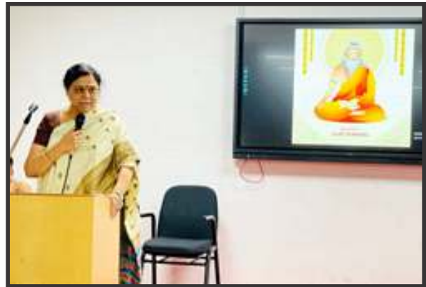
Celebration of GURU PURNIMA on 13th July 22 at AHMC.