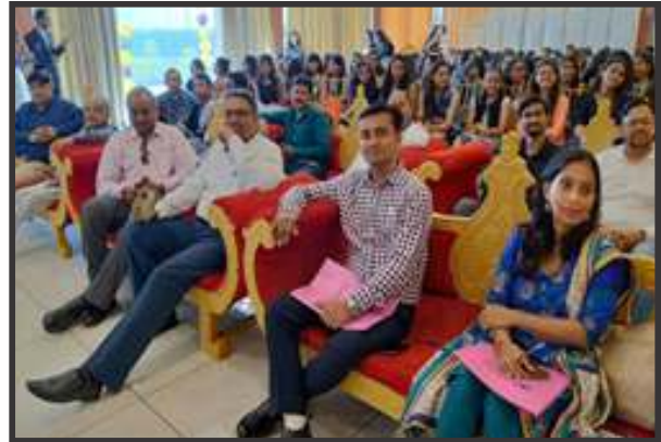
Jawaharlal Nehru Homoeopathic Medical College, Parul University has organized Doctors Day along with Fresher's Day celebration on 1st July 2022 at 11am at Bhavan's Party Plot, Vadodara