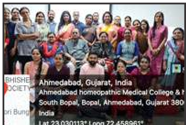
Teachers Training Interactive Sessions held on 9th July 2022 by Human Resource Cell of AHMC, Parul University, where in Topics like