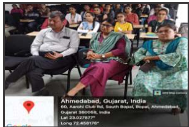
On 13th July Continuous Education Program(CEP) commenced at AHMC Campus