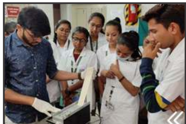
13-7-22_1ST BHMS ECG WORKSHOP at RHMC